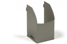
M-PTH Pencil Cup M-Series