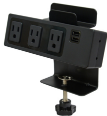
P32B-C PowerUP™ Clamp-On Power Dock