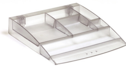
S-AT Accessory Tray S-Series