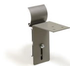
CLP Stabilizing Clip (For 3X Model Only)