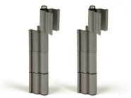
HGEU Universal Hinge Kit Stationary Office Partitions