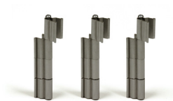
HGEUM Universal Hinge Kit Mobile Office Partitions