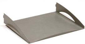
M-LTH Letter Tray M-Series